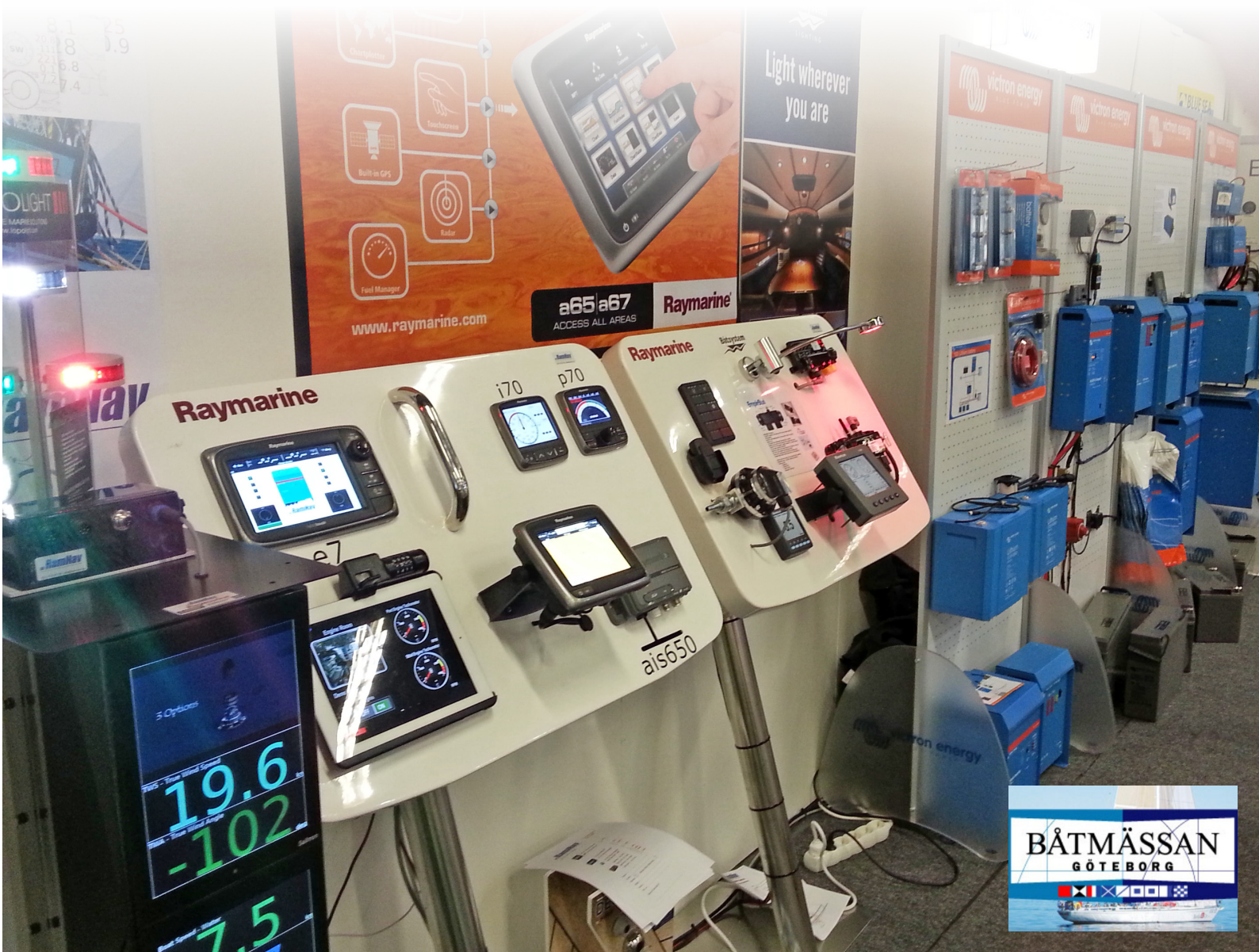
NMEA2000 system with Victron Energy, Raymarine and Empirbus.

NMEA2000 is an open CAN-bus network in which equipment from different manufacturers can communicate with each other.