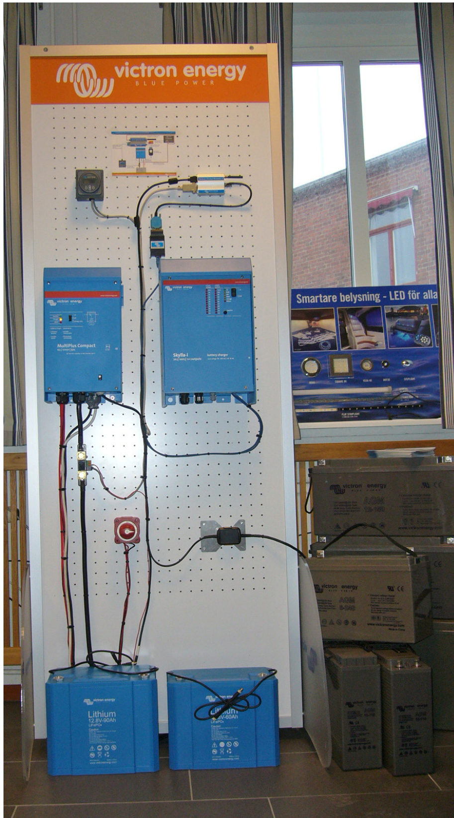
Victron system with BMW, Victron Global Remote, MultiPlus Compact, Skylla-i, Lithium 12,8V batteries and NMEA2000 interface.